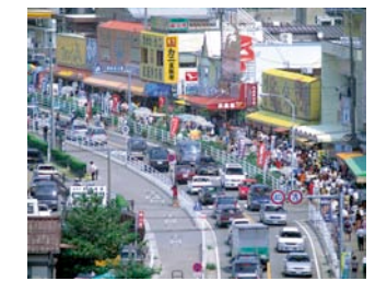
Teradomari Fish Market