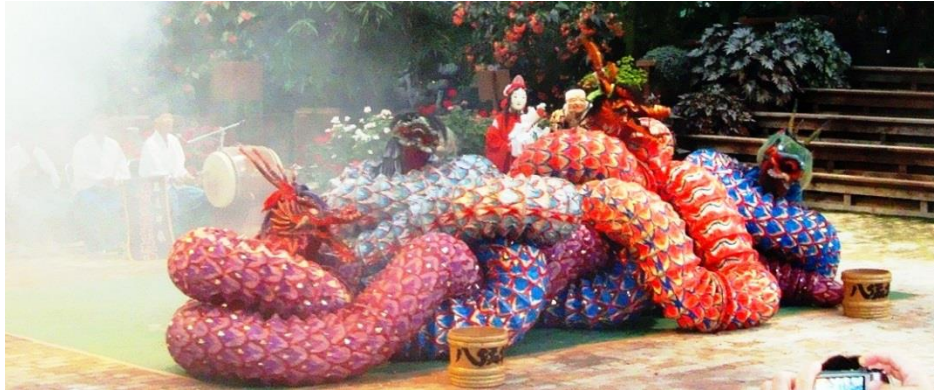
Traditional Kagura-Mai (Shinto dance)

Iwami Kagura: http://iwami-kagura.com/ (ENGLISH) http://iwamikagura.jp/ (JAPANESE)