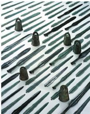
Bronze implements from the Kojindani site (National treasures)

Shimane Museum of Ancient Izumo: http://www.izm.ed.jp/english/ (ENGLISH) http://www.izm.ed.jp/ (JAPANESE)