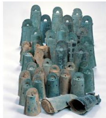
Bronze bells from the Kamo-Iwakura site (Important cultural properties)

Matsue Vogel Park: http://www.vogel.jp/English/index2.html (ENGLISH) http://www.vogel.jp/ (JAPANESE)